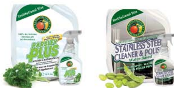
Product Graphic Composites