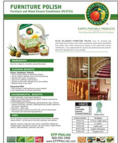
Product Sell Sheet