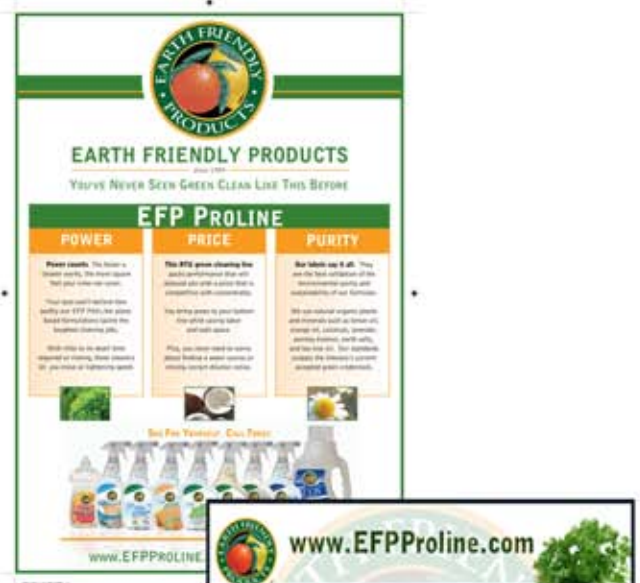
Ad creation and placement